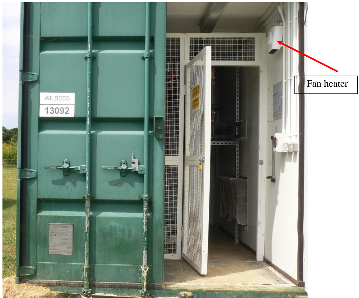
Figure 7 : HV switchgear zone showing location of the heater