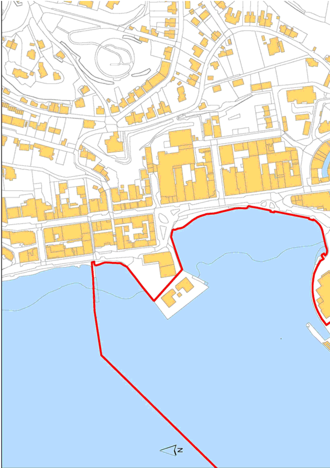
Inset Plan 3

Status: This is the original version (as it was originally made). This item of legislation is currently only available in its original format.